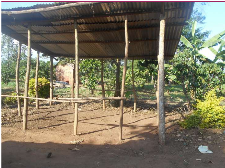
The shelter used by the women before Bunty's Bothy

Therefore, Bunty's Bothy is a small building for Leading Change Uganda with LCU's Offices, a Community Reading Club, Meeting space/ training center for the Women and children built with support from our friends from Scotland.